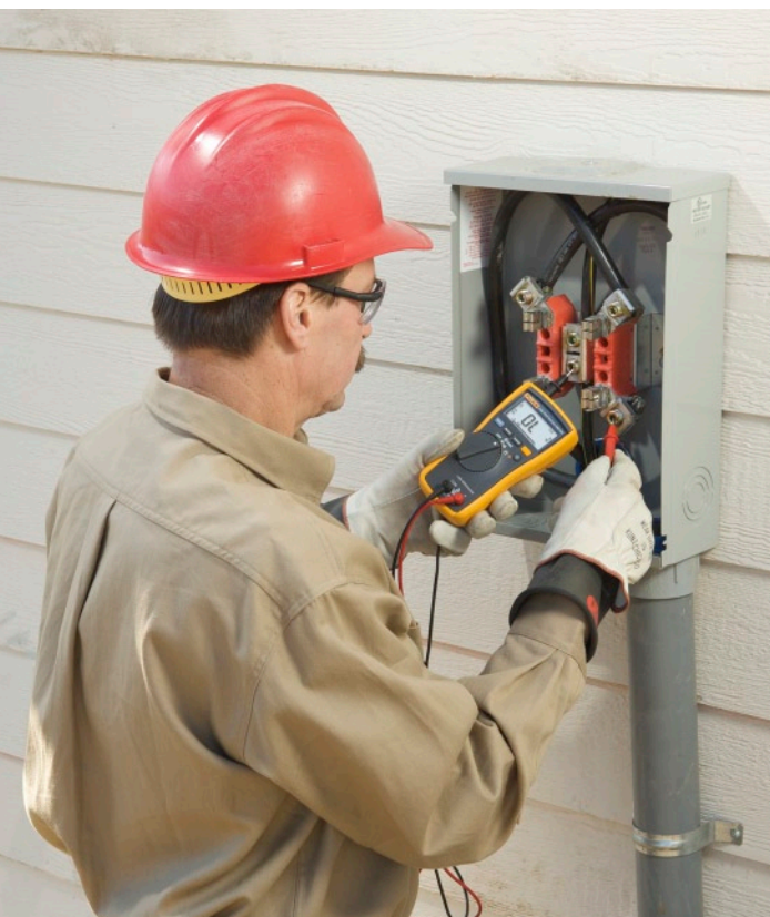
Measuring load side to neutral.