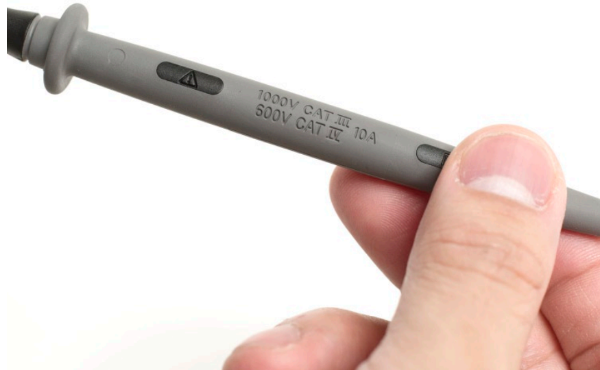
1000V CAT III, 600V CAT IV, 10A

The NFPA 70E standard also requires that the test tools used on the job be rated for the environment they will be used in. This applies to both the meter and the test leads/probes, and any PPE (Personal Protective Equipment) necessary for safe measurements. PPE ratings are somewhat different than CAT ratings, as illustrated in Table 2.