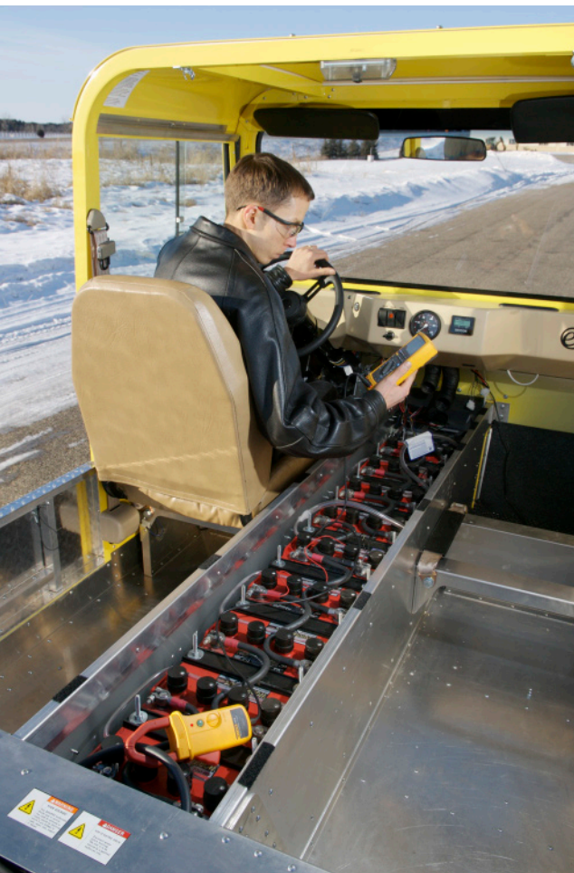
Gathering current readings on an e-ride EXV-2.

"I had hoped to use a coil driver from an existing company, but the price was too high, and I figured that the best option would be to develop my own. I learned that developing a coil driver is not a simple thing; designing the high-voltage analog engineering portion of the power supply and everything related to it was a challenge. Once I got beyond the coil driver, it was easy going. Essentially, the task was then an embedded application of a controller."