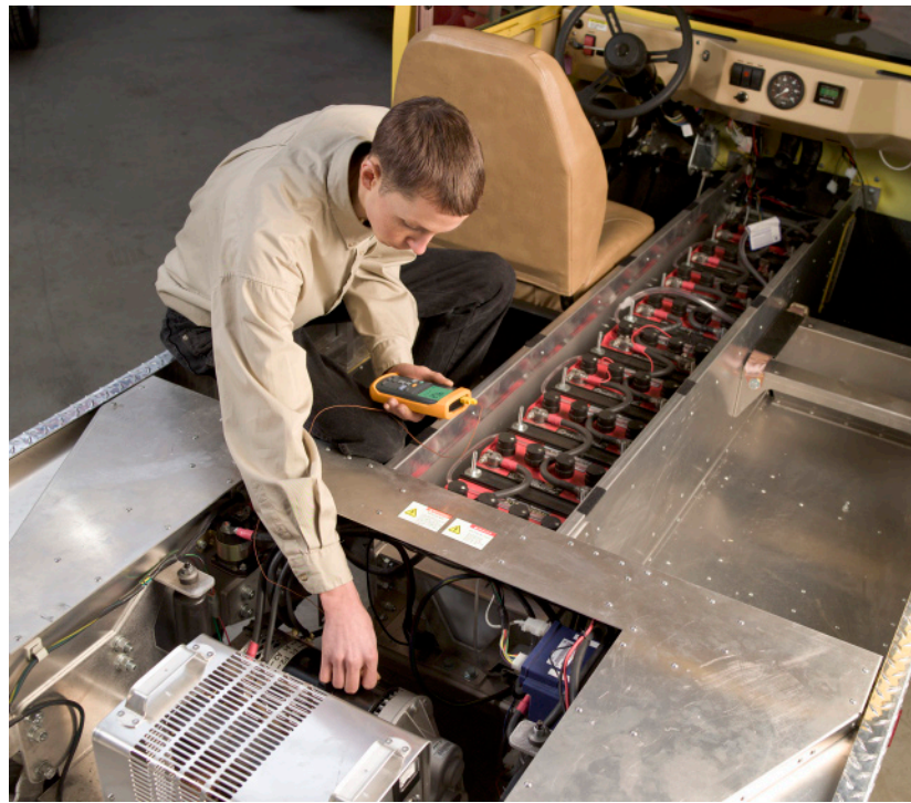
Monitoring motor temperature on an e-ride EXV-4.

For an industry that has seen little evolution in the architecture of the internal-combustion engine since its introduction in the 1920s, innovation is now running wild.