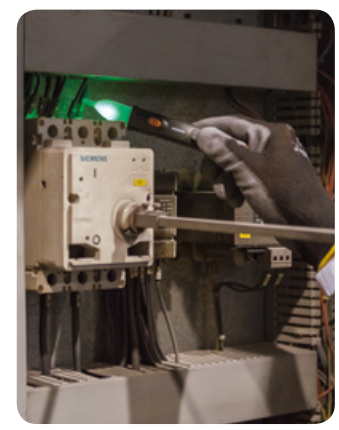
assumed phase L1 of the three-phase assumed phase L2 (on the conductor or steady light, phase sequence is correct. system (on the conductor or sheath) for sheath) for at least another 5s and wait If, however, the red LED flashes, phase