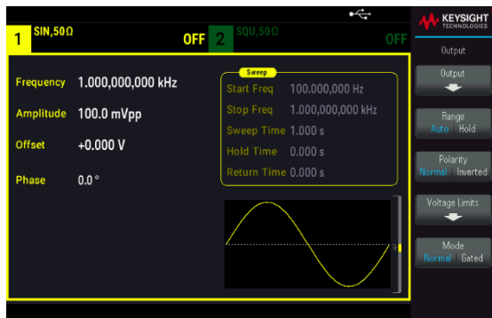
Figure 1. Standard sine wave and setting

The EDU33210 Series 20 MHz function / arbitrary waveform generators has 17 built-in arbitrary waveforms. It comes with common waveforms — sine, square, ramp, triangle, pulse, PRBS, DC, and Gaussian noise; see Figures 1 and 2. It has specialty waveforms such as cardiac, exponential fall, exponential rise, Gaussian pulse, haversine, Lorentz, D-Lorentz, negative ramp, and sinc; see Figures 3 and 4. The six built-in modulations are AM, FM, phase modulation (PM), frequency-shift keying (FSK), binary phase shift keying (BPSK), and pulse width modulation (PWM).