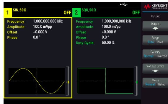
Figure 2. Dual-screen display of standard sine and square wave