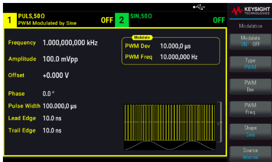
Figure 3. PWM modulated with standard sine wave