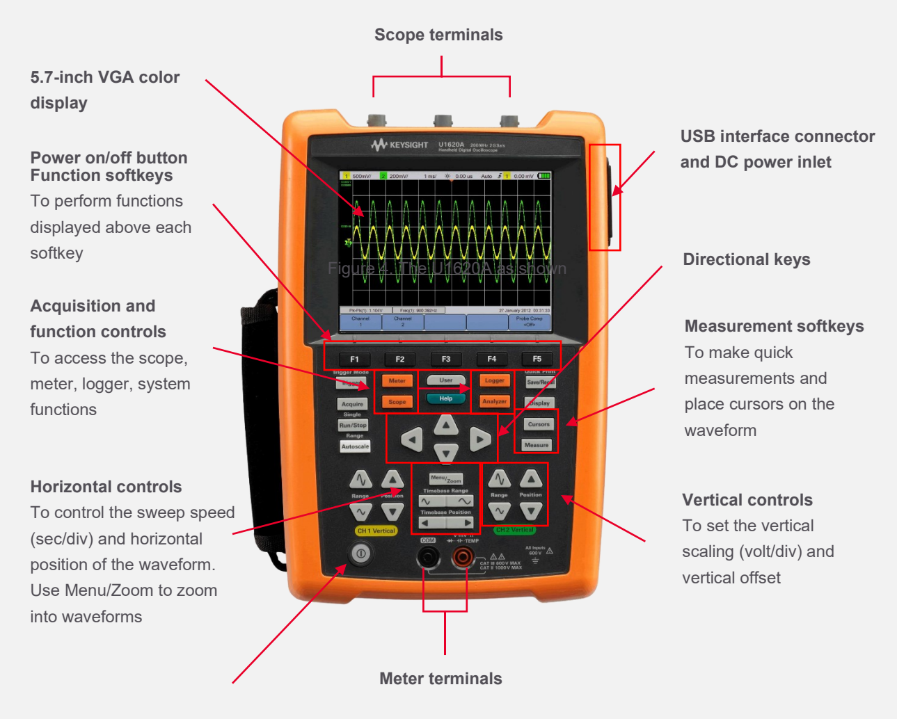
Outdoor viewing mode as illustrated