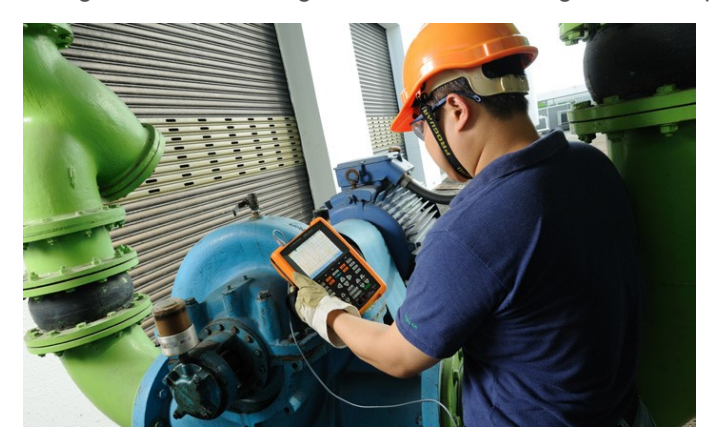
Figure 2. Outdoor mode that is sunlight viewable

When performing field work in an outdoor environment, users can easily switch to this viewing mode via a set of accessible soft keys. This mode works in an anti-glare mechanism; it filters out excessive sunlight, hence reducing the risk of misreading or misinterpreting measurements.