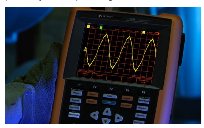
Figure 3. Night vision mode for performing tasks in a poorly lit environment

The night vision mode is tailored to be viewable under subdued lighting by enabling high contrast levels between the screen background and waveforms. With a single press of button, this mode is activated, and the screen automatically adjusts with proper color correction-creating clear contrasts between the wave- forms against the dark environment. This mode is useful when measuring high speed signals, particularly in non-repetitive signals.