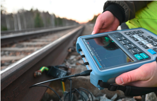
Measure railway track isolation at different frequencies

Oscilloscopes are basic everyday instruments for engineers and electricians. Maintenance tasks, however, sometimes require very specific measurements that are not available as standard functionality or are difficult to set up manually. With the R&S®RTH-K38 user scripting option, engineers can now design their own measurement function and a simple user interface. This paper describes how to use this unique feature for railway maintenance work.