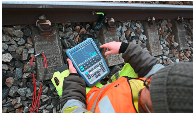
The R&S®Scope Rider RTH oscilloscope in spectrum mode measuring the spectral content of the communications signal

frequencies using cursors and the logging functionality of the oscilloscope. In this use case, it is necessary to measure a signal current at four different frequencies (16 2/3 Hz, 50 Hz, 95 Hz and 105 Hz) and display the signal amplitude in Ampere at these frequencies. Such a specific measurement is certainly not a standard functionality on any handheld oscilloscope. There was also a request for an automatically executed setup on the device, a display of the maximum values of the currents and a graphical representation in order to make operation as simple as possible for the engineers.