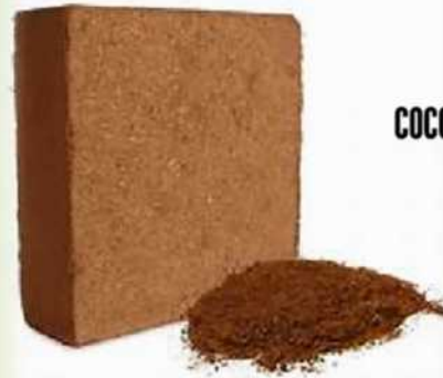
COCO PEAT BALE

One of our well-known products is the Coir 5 Kg compressed brick. This product is quite popular and made entirely from coir pith most of the time. It serves as an excellent growing medium for a wide variety of crops. Additionally, this brick can also be used to improve soil quality by mixing it with nutrient-deficient soil. In simpler terms, this compressed brick made from coir pith is used for both growing plants effectively and enhancing the quality of less nutritious soil.