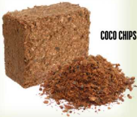
COCO CHIPS BALE