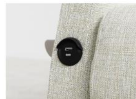
USB power (fixed arm)