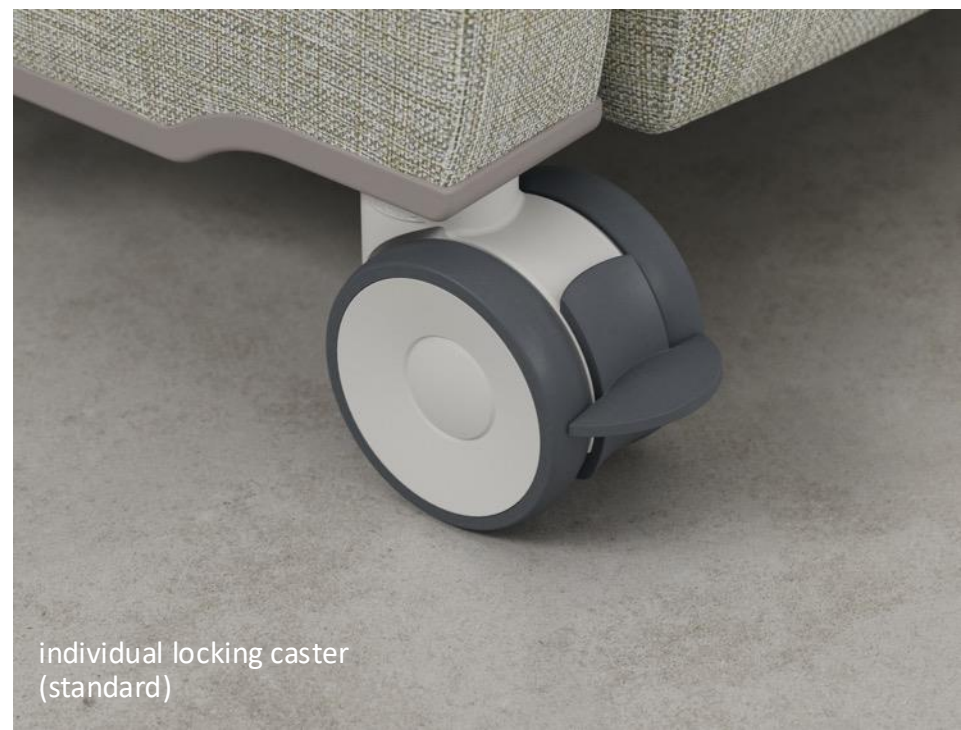
individual locking caster (standard)