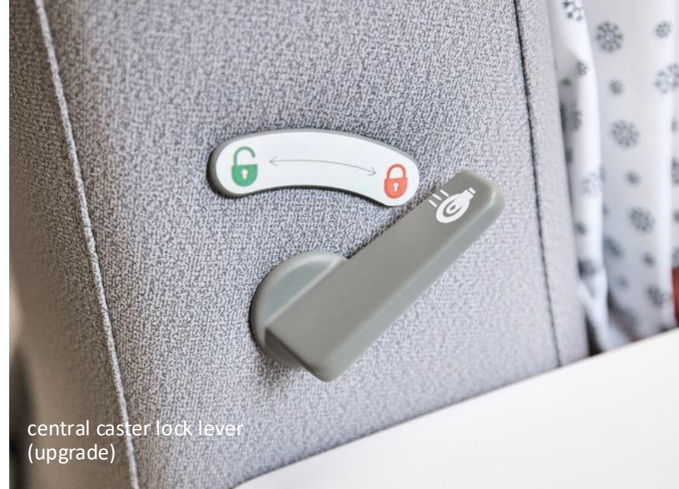
central caster lock lever (upgrade)