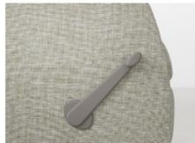
R and/or L footrest handle