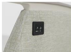
heat and massage (fixed arm)