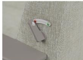
central locking casters