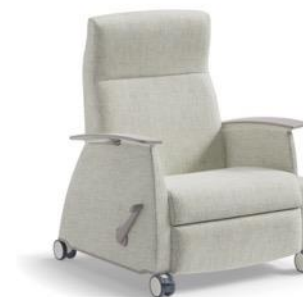
bariatric single transfer arm recliner