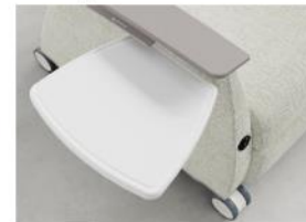
3D laminate or solid surface (fixed arm)