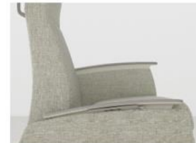
single or dual transfer arms