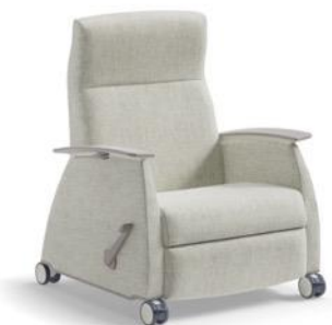
bariatric fixed arm recliner