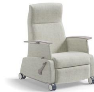
dual transfer arm recliner*