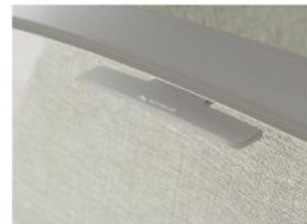
dual back recline levers