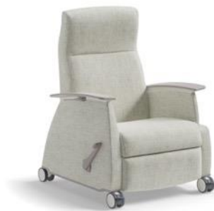
single transfer arm recliner*