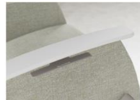
solid surface (designer white only)