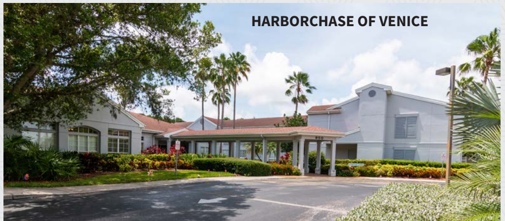
HARBORCHASE OF VENICE