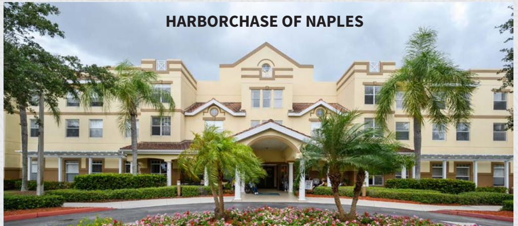
HARBORCHASE OF NAPLES