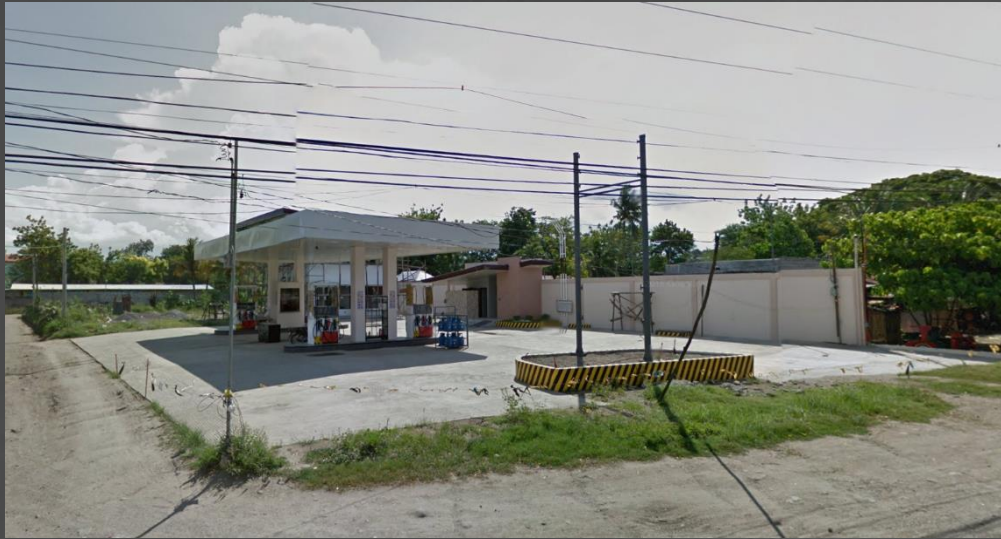
View from the corner of NLSA Rd. and Villareal St.