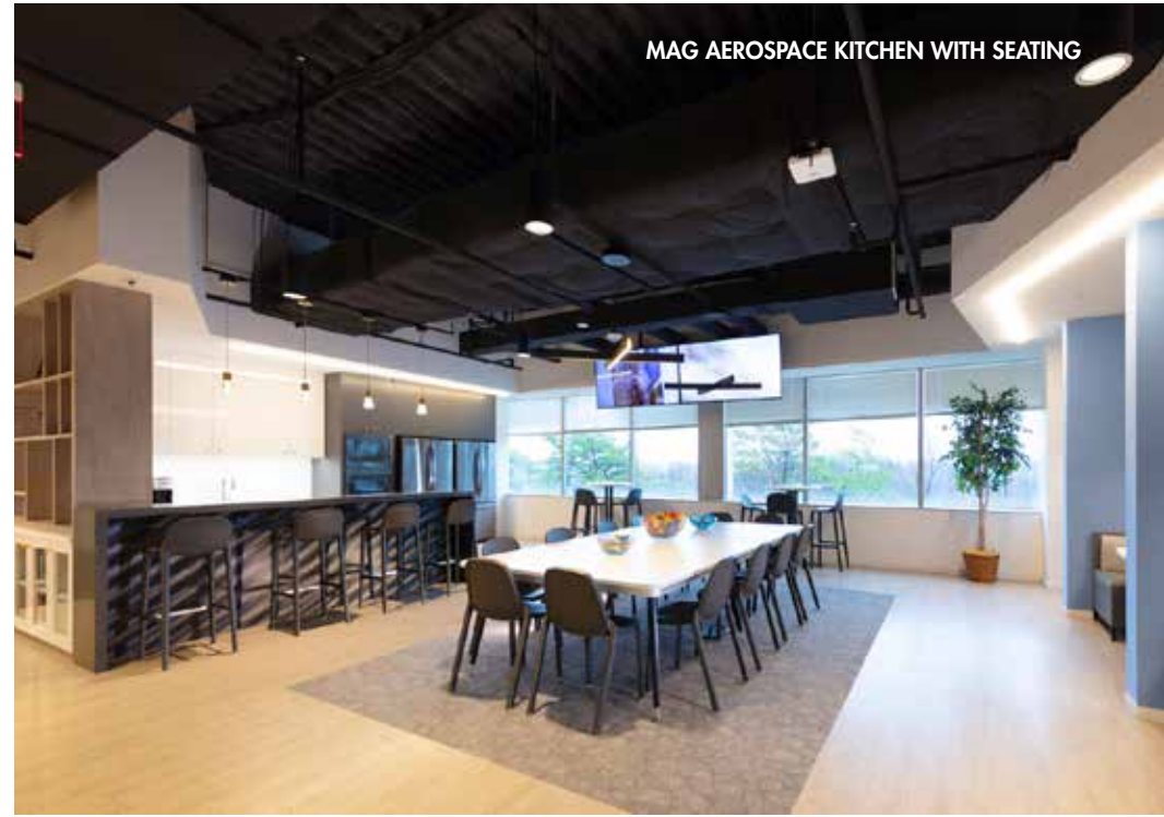
MAG AEROSPACE KITCHEN WITH SEATING