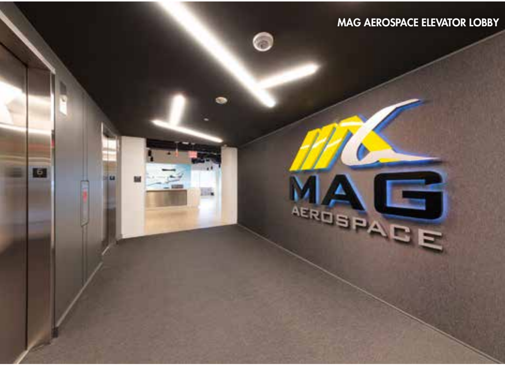
MAG AEROSPACE ELEVATOR LOBBY