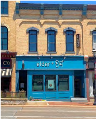
ELDER + OAT (Opened July 2020)

West Dundee is a quaint village situated along the Fox River Greenway, one of the region's finest recreational areas. The community has preserved its rich history and small town feel through the restoration of historical buildings downtown.