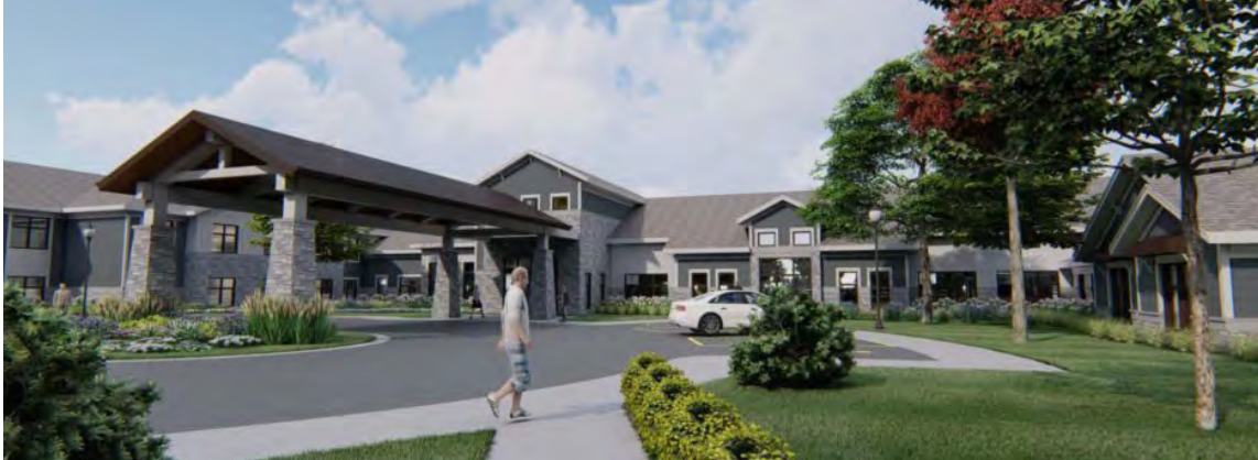
WOODLANDS AT CANTERFIELD (Nelson Development Project)