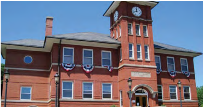
WEST DUNDEE VILLAGE HALL