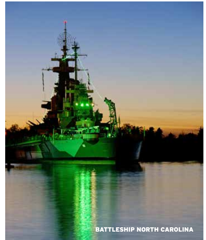
BATTLESHIP NORTH CAROLINA