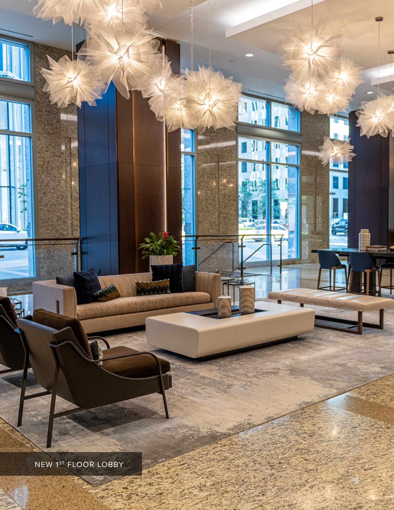
NEW 1 ST FLOOR LOBBY