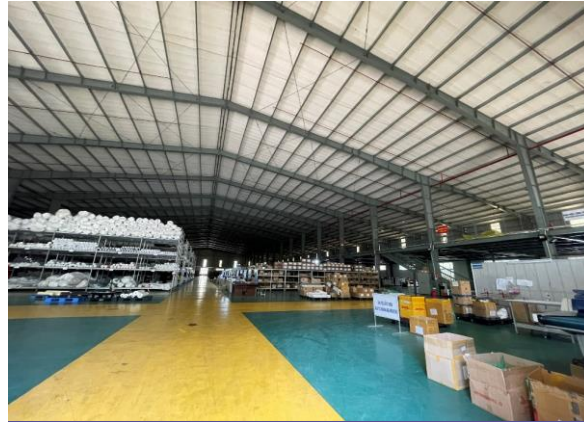
1 - Storage 1