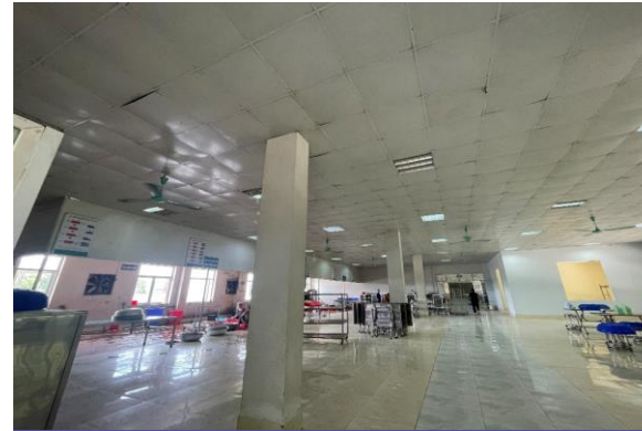
3 - Canteen