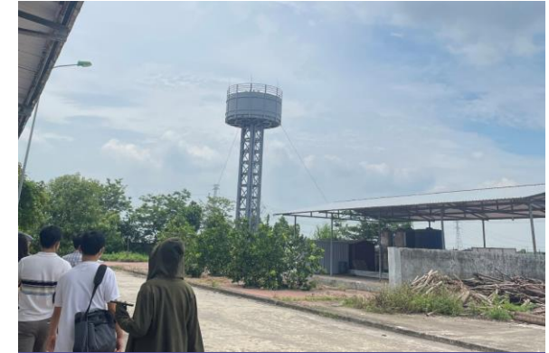
6 - Water Tank