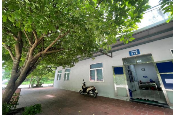
3 - Medical Room