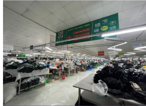
2 - Workshop (1 st floor)