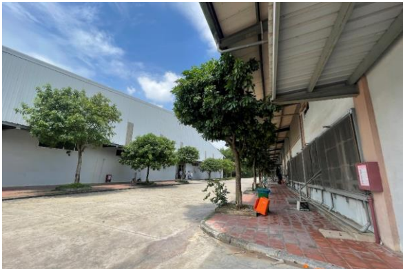
Internal Road between facilities (1) & (2)