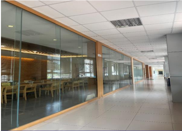
1 - Office