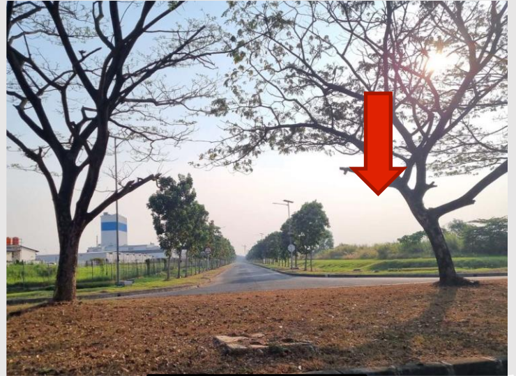
Front Left (4)