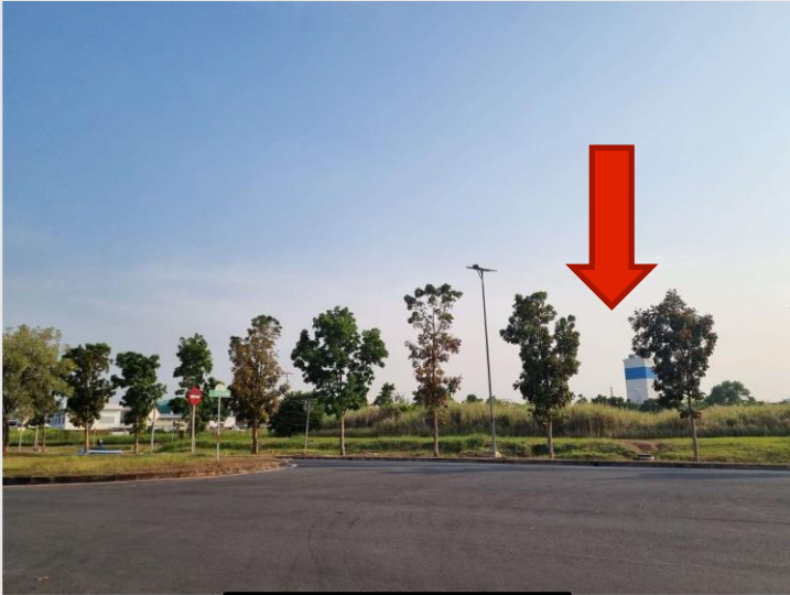
Front Right (1)