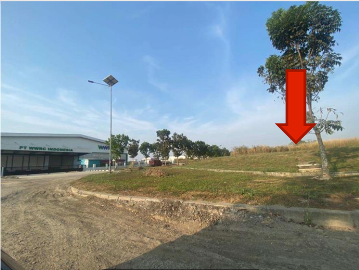
Back Right (2)