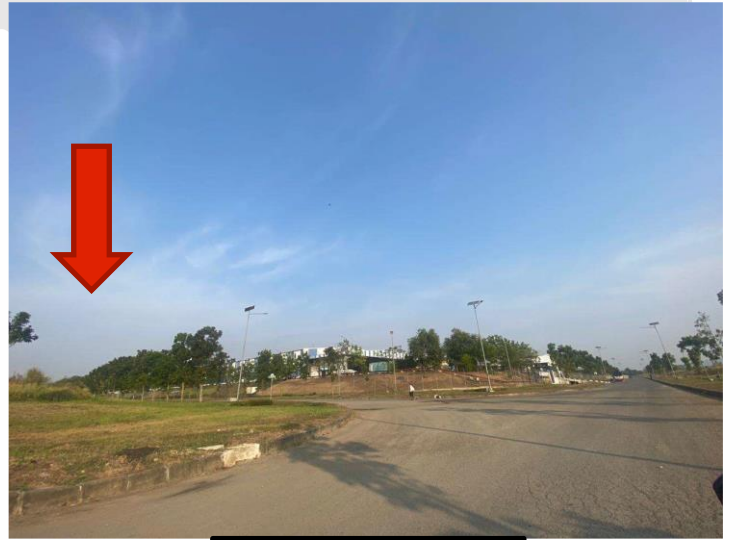
Back Left (3)