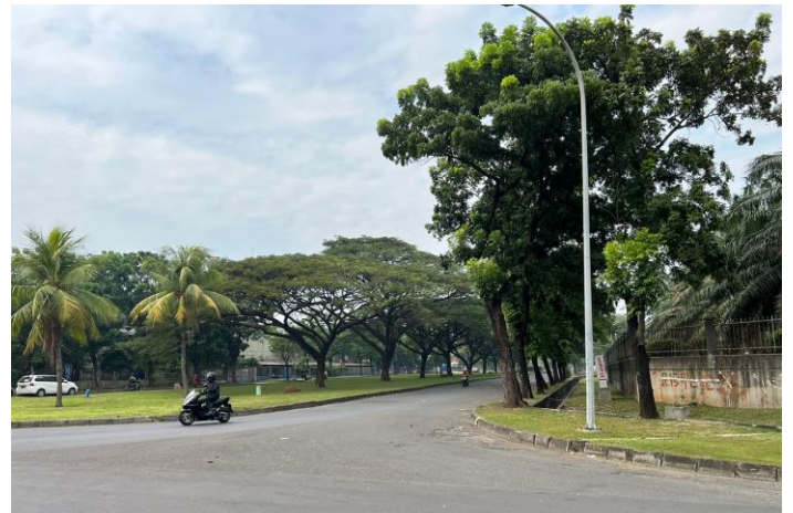
Access from Jl Jababeka XVIIB