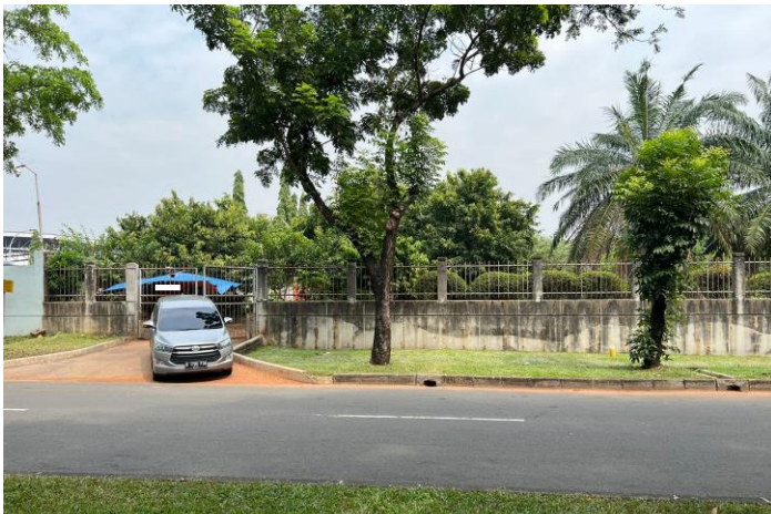
Property Main Gate