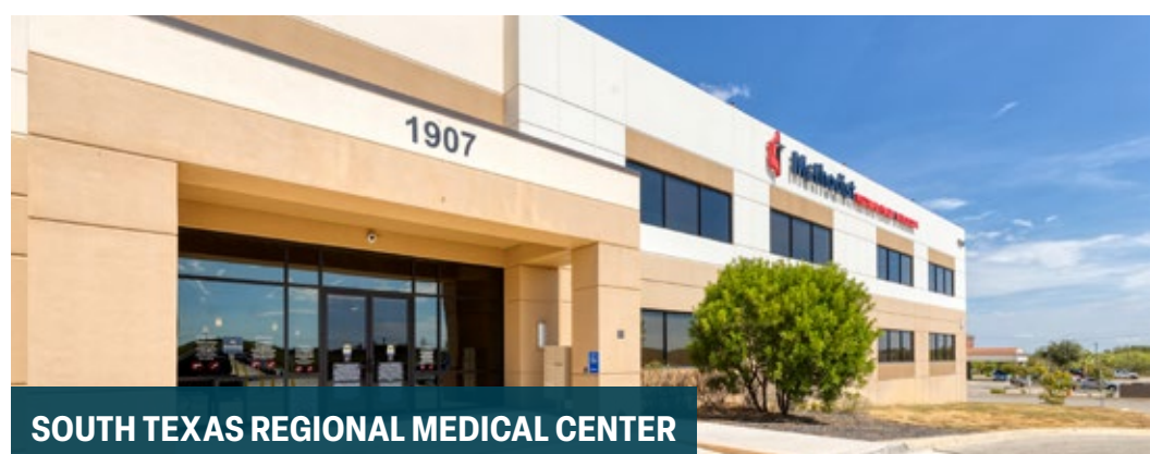
SOUTH TEXAS REGIONAL MEDICAL CENTER