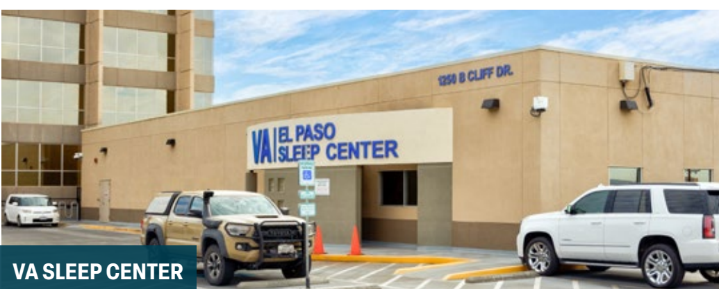
VA SLEEP CENTER