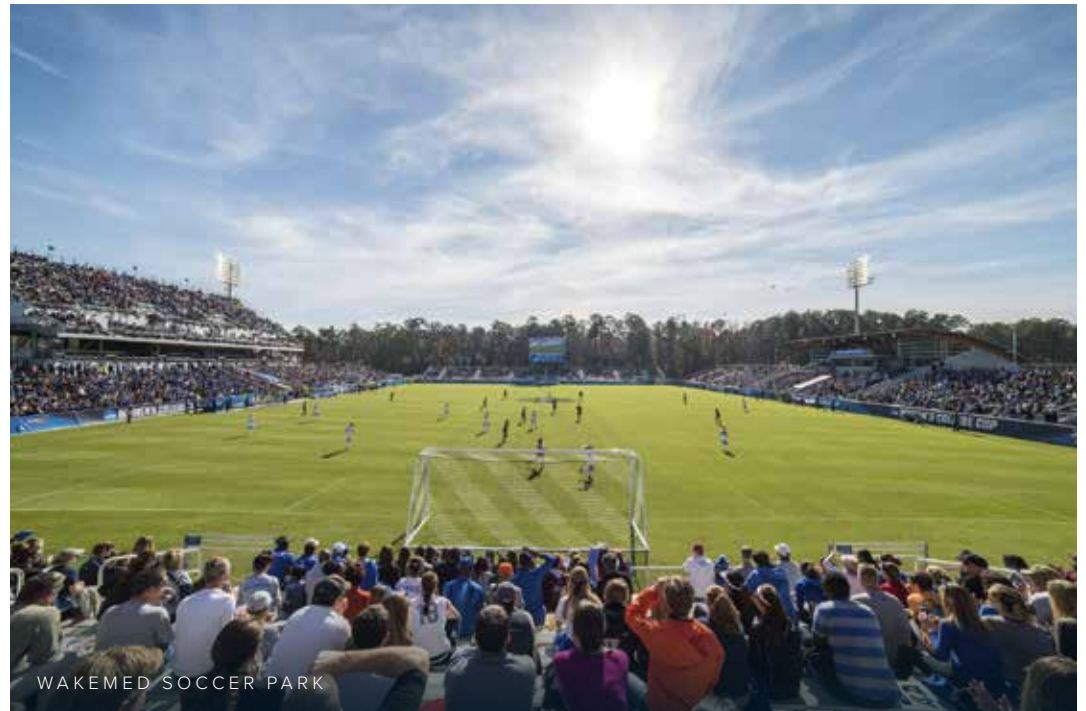
WAKEMED SOCCER PARK