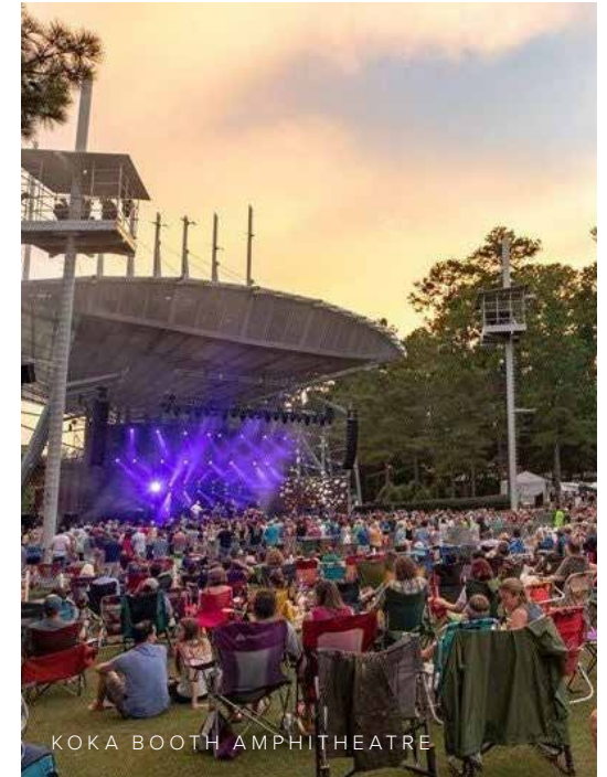
KOKA BOOTH AMPHITHEATRE