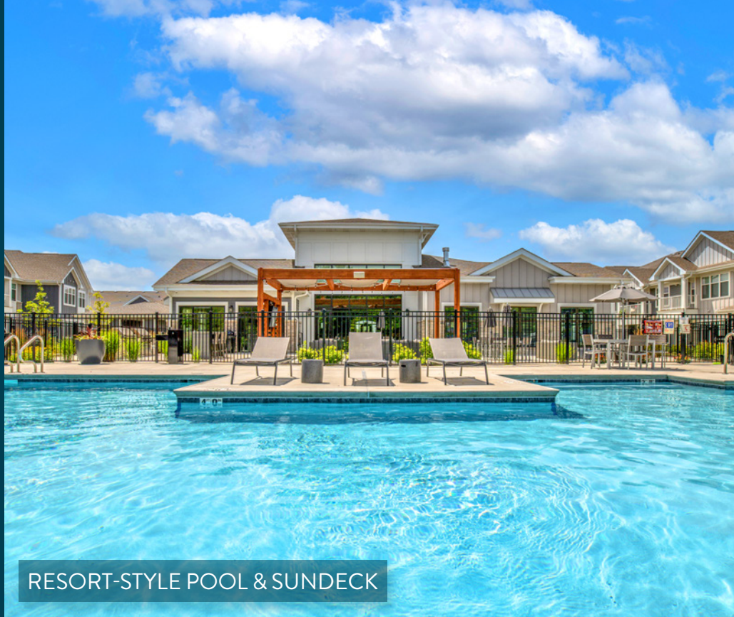
RESORT-STYLE POOL & SUNDECK