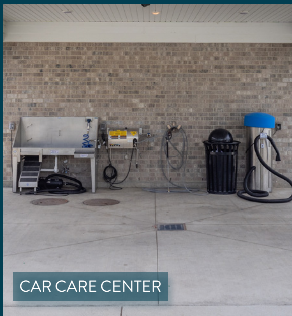
CAR CARE CENTER