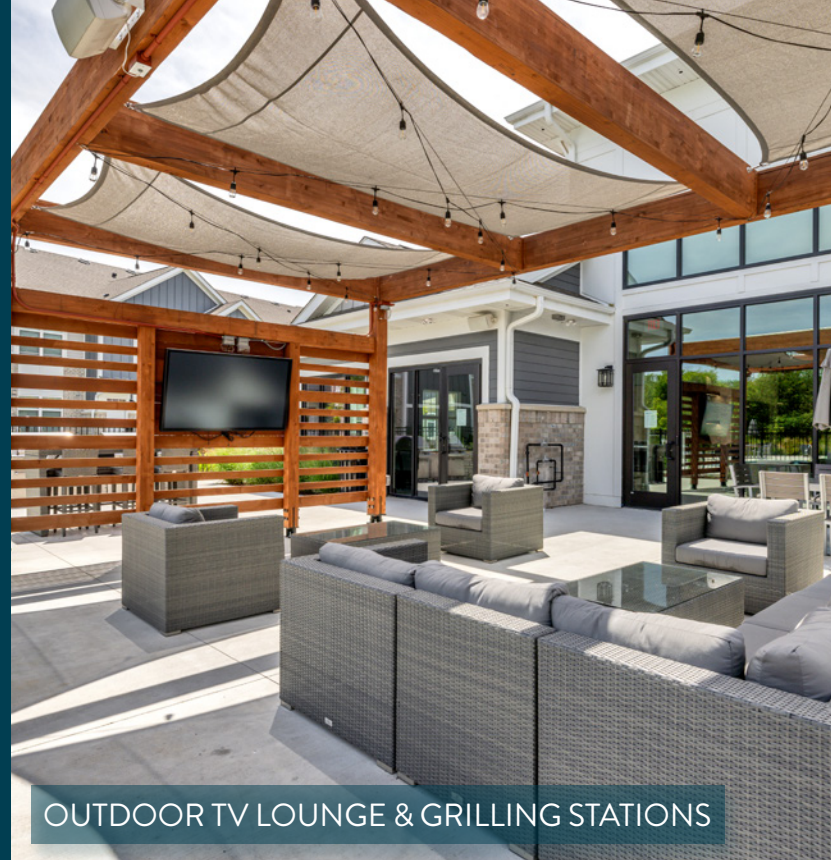
OUTDOOR TV LOUNGE & GRILLING STATIONS