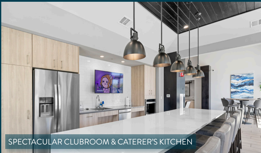
SPECTACULAR CLUBROOM & CATERER'S KITCHEN

Seasons residents can enjoy the best of the best amenity package, great for working from home, exercising, relaxing or even entertaining.