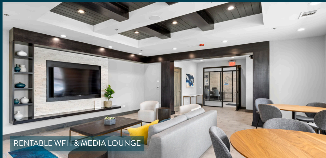
RENTABLE WFH & MEDIA LOUNGE