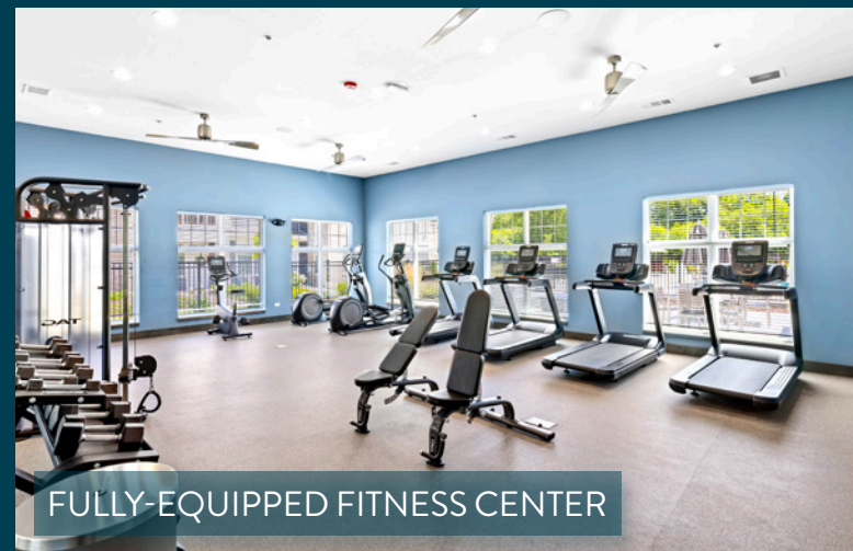
FULLY-EQUIPPED FITNESS CENTER