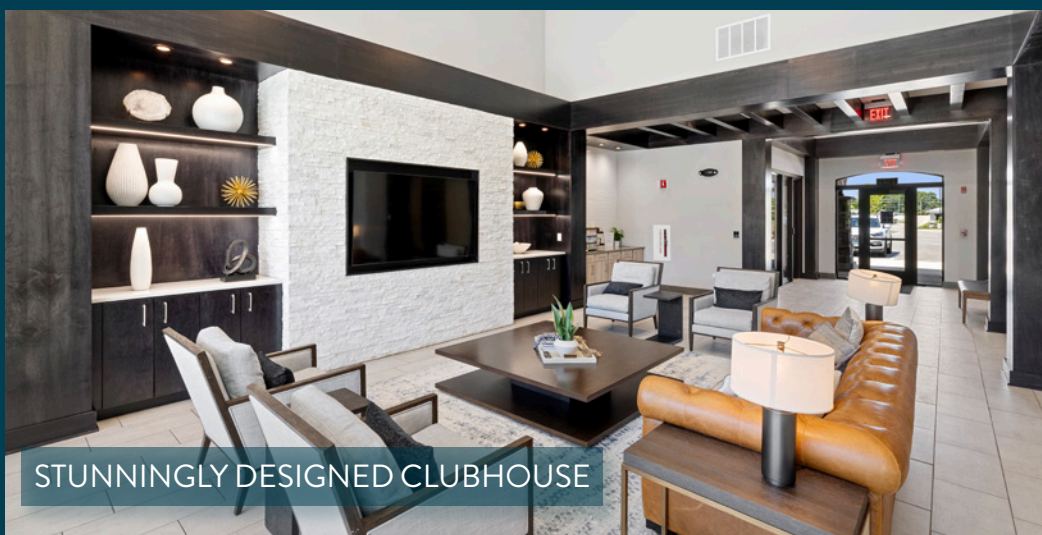
STUNNINGLY DESIGNED CLUBHOUSE