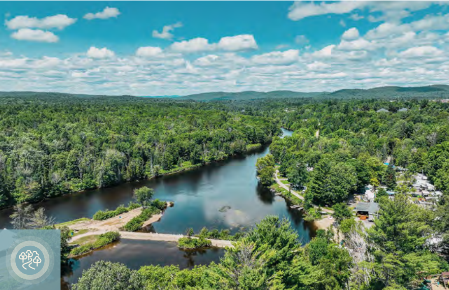
THE TOWN OFFERS A PERFECT BLEND OF URBAN AMENITIES AND SERENE NATURAL BEAUTY

Sainte-Julienne and Rawdon offer a desirable quality of life, making them appealing destinations for those seeking a serene and idyllic place to call home.