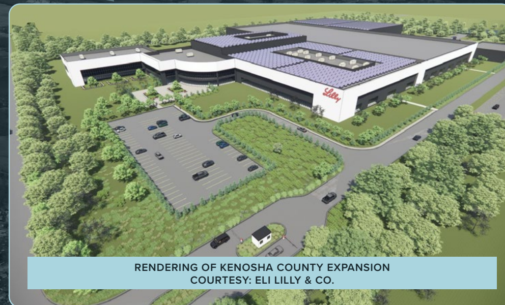
RENDERING OF KENOSHA COUNTY EXPANSION COURTESY: ELI LILLY & CO.