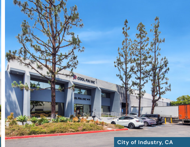
City of Industry, CA