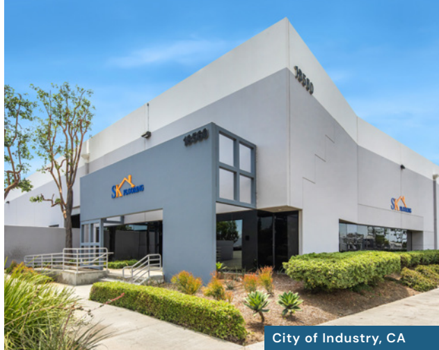
City of Industry, CA