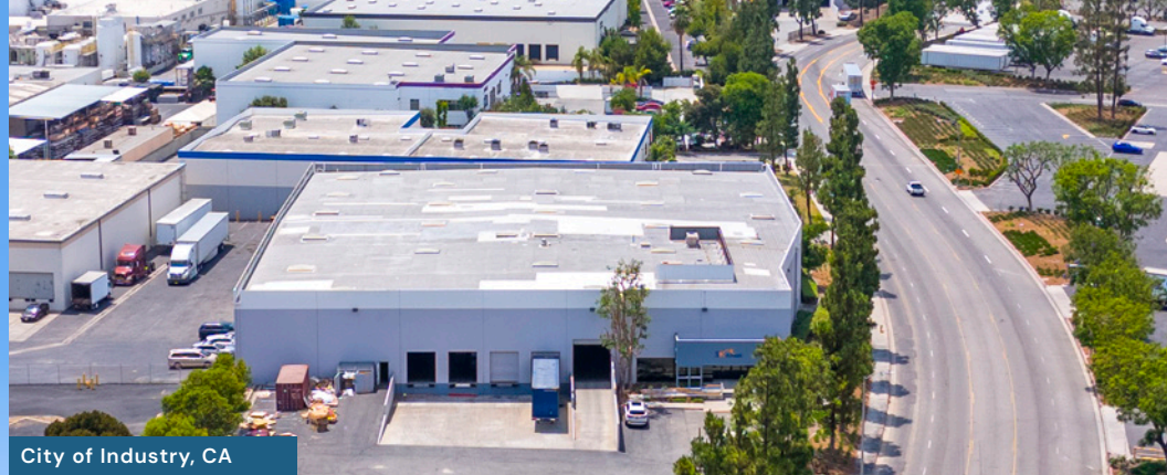
City of Industry, CA