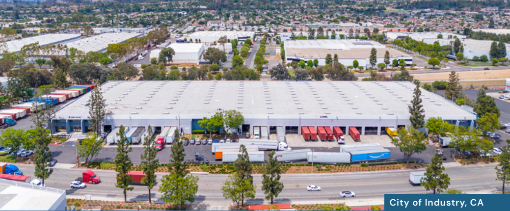
City of Industry, CA