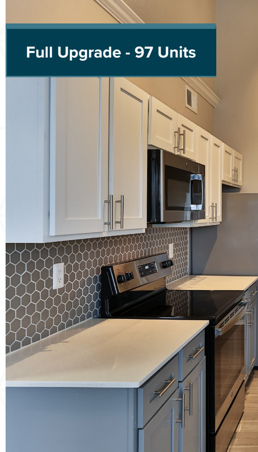
Full Upgrade - 97 Units