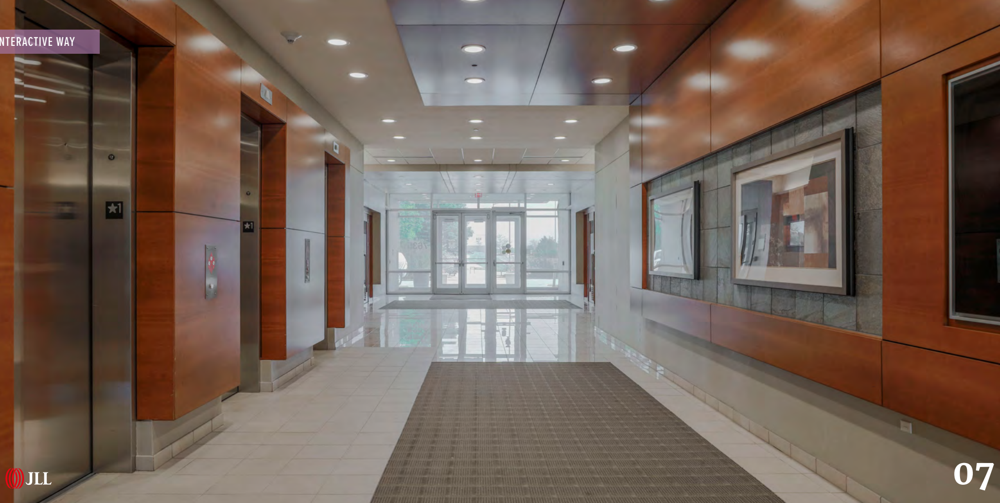
7635 INTERACTIVE WAY