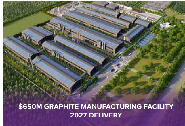
EPSILON'S MANUFACTURING FACILITY: BRUNSWICK COUNTY