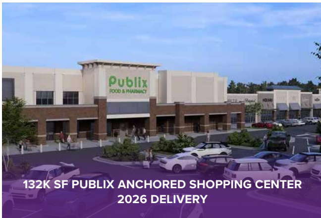
LELAND VILLAGE: BRUNSWICK COUNTY