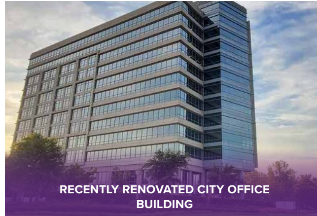
SKYLINE CENTER: NEW HANOVER COUNTY