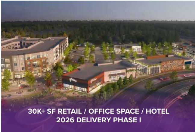
CENTER POINT: NEW HANOVER COUNTY