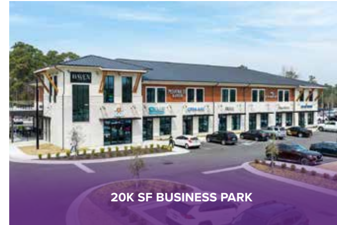
OYSTER LANDING: PENDER COUNTY