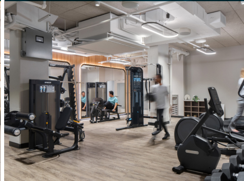
EXPANDED & RENOVATED FITNESS CENTER