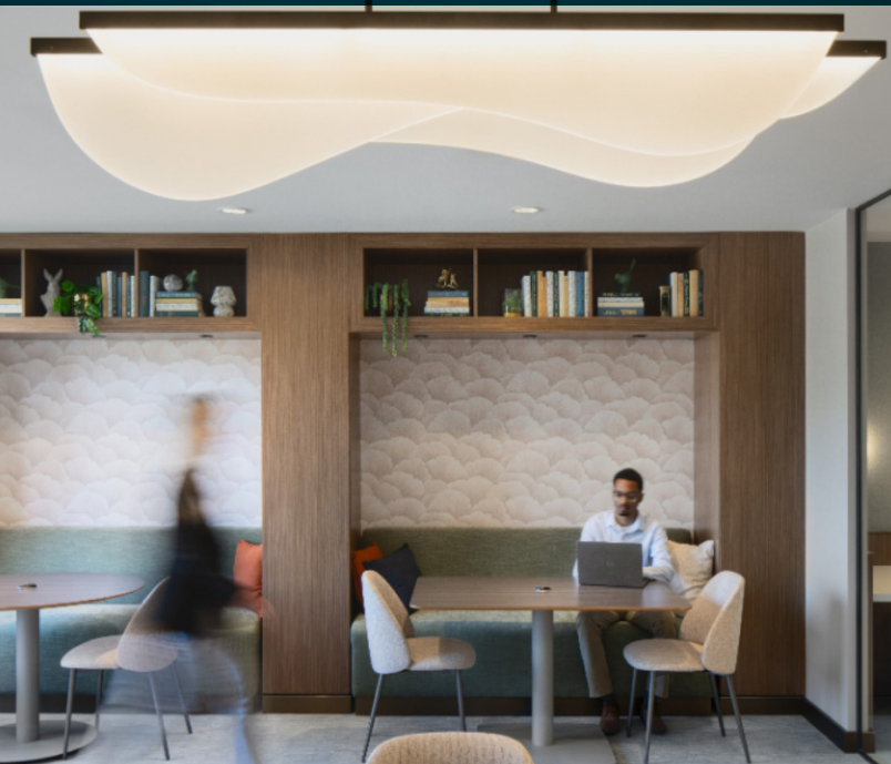
NEW CO-WORKING SPACE