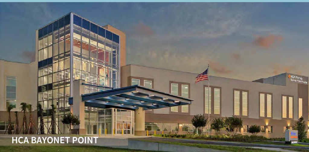
HCA BAYONET POINT