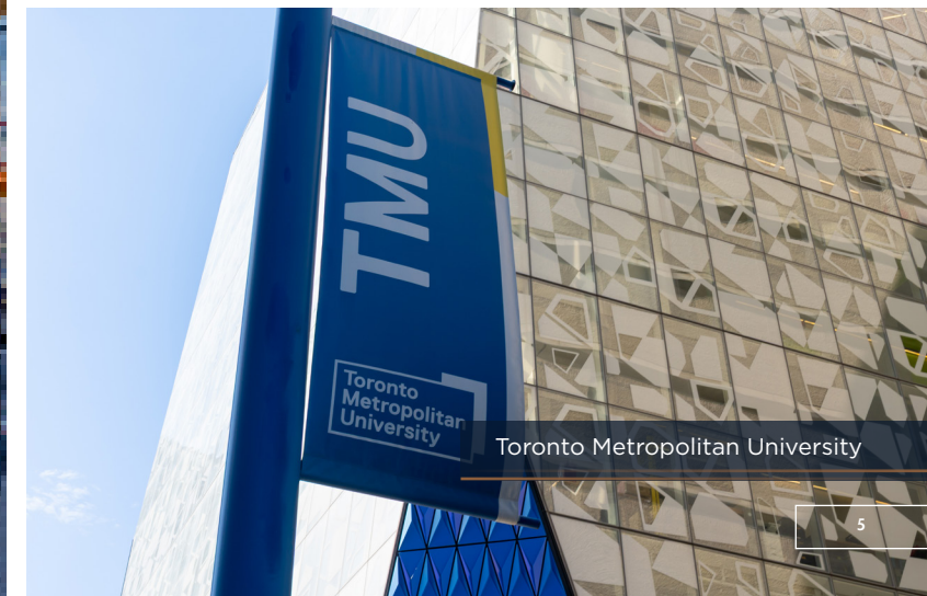
Toronto Metropolitan University