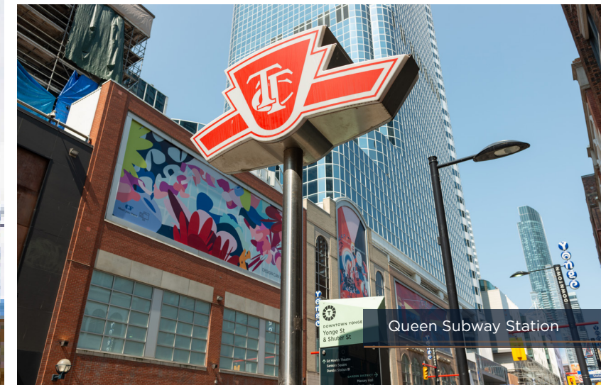
Queen Subway Station