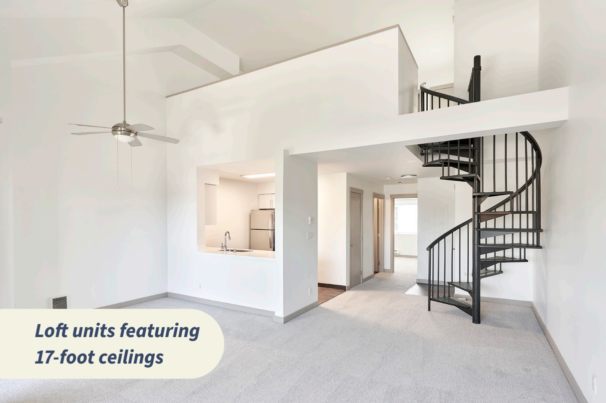
Loft units featuring 17-foot ceilings