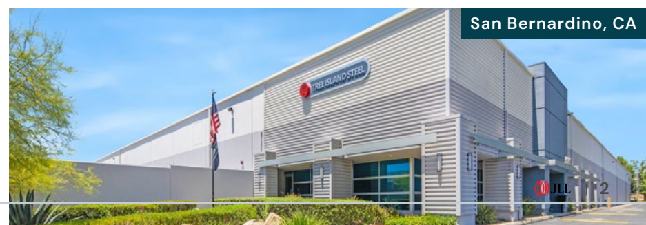
San Bernardino, CA