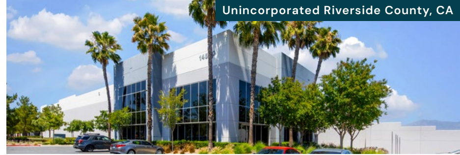
Unincorporated Riverside County, CA