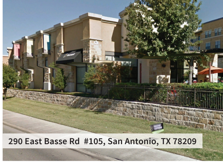
290 East Basse Rd #105, San Antonio, TX 78209