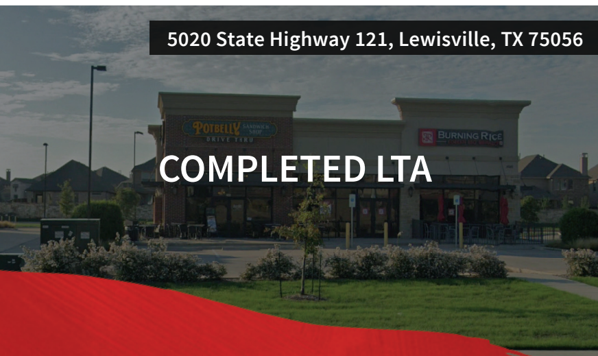
5020 State Highway 121, Lewisville, TX 75056