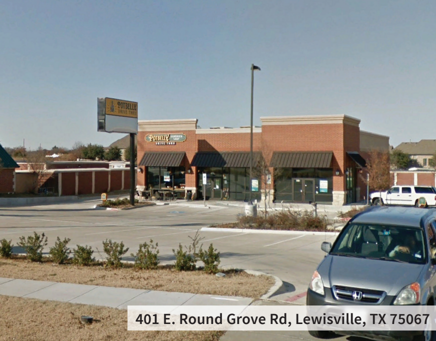
401 E. Round Grove Rd, Lewisville, TX 75067