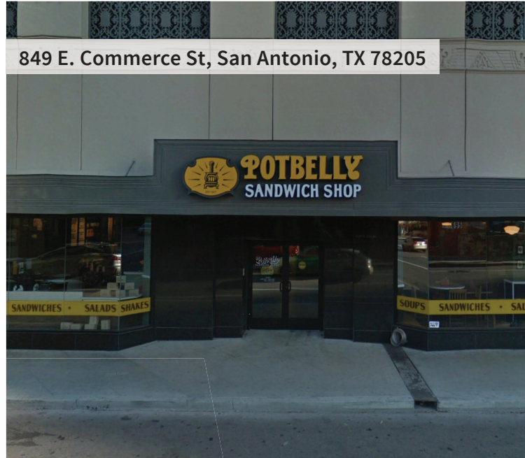
849 E. Commerce St, San Antonio, TX 78205