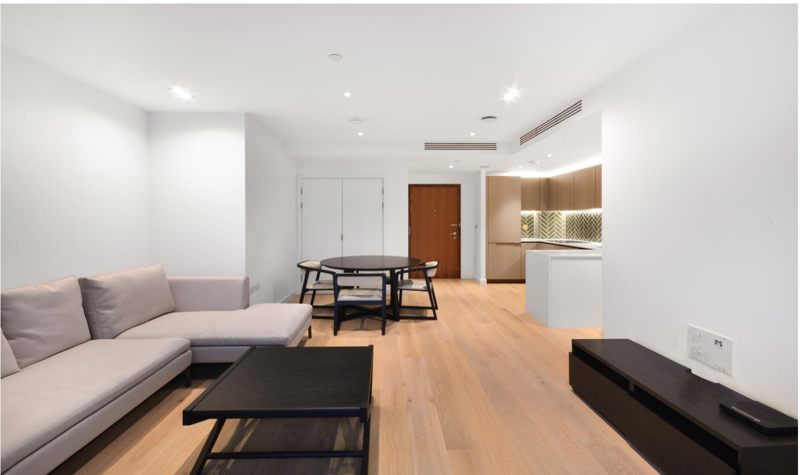
THE ATLAS BUILDING, LONDON EC1V