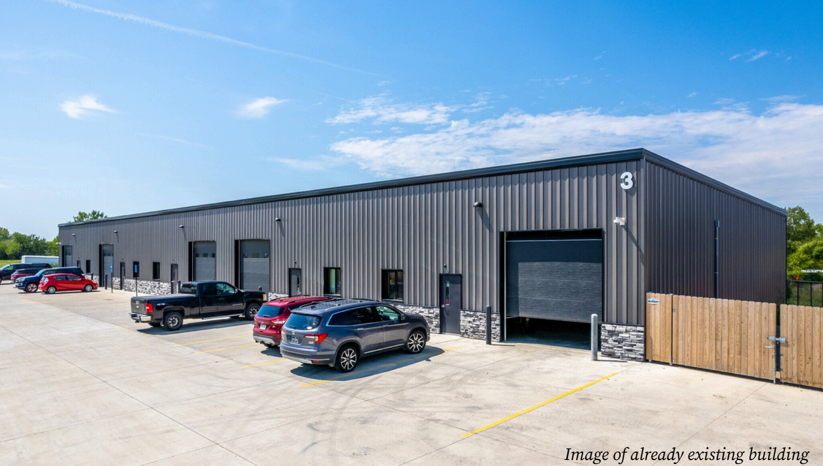
Image of already existing building