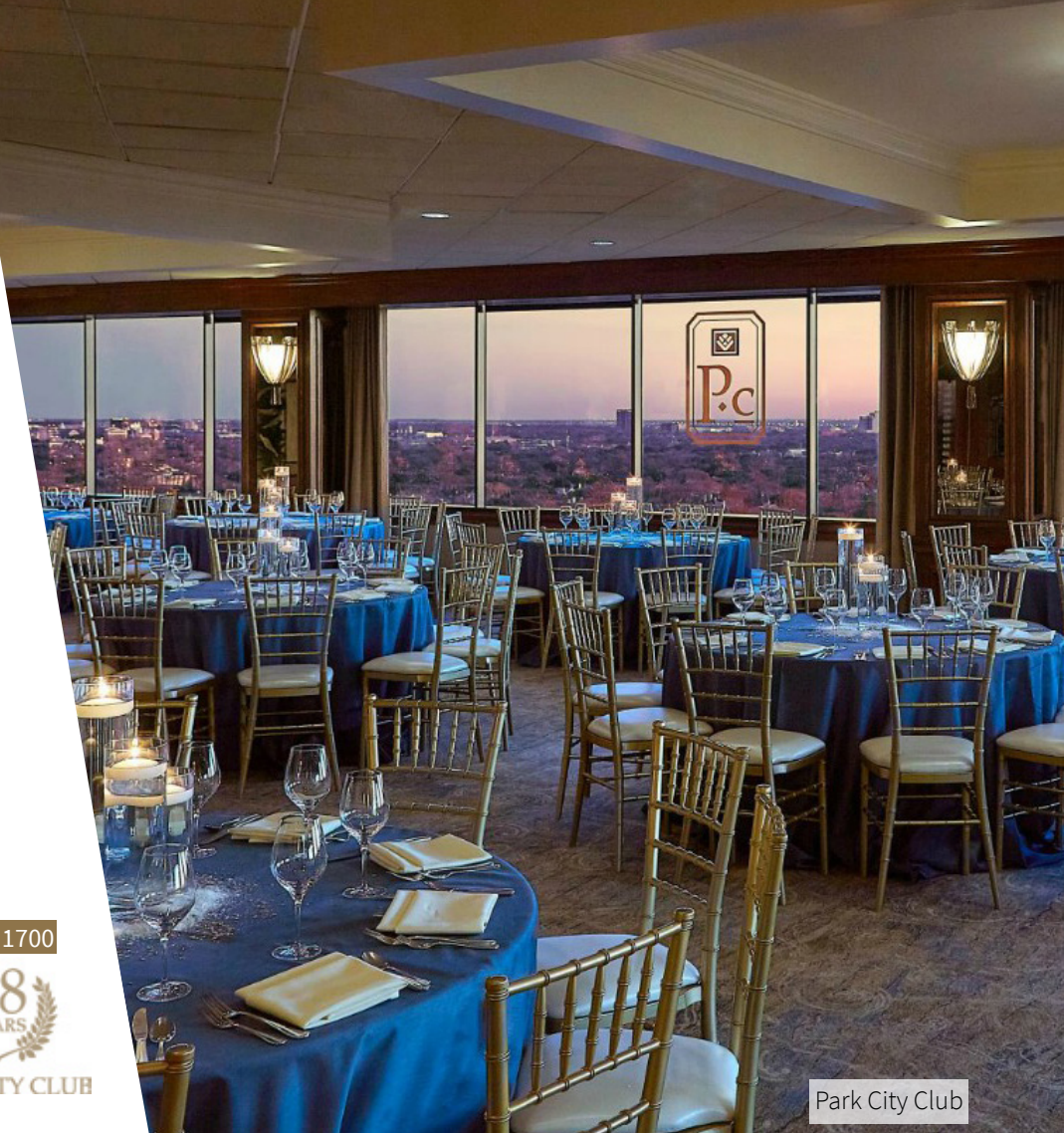
Park City Club