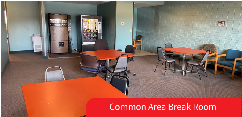
Common Area Break Room