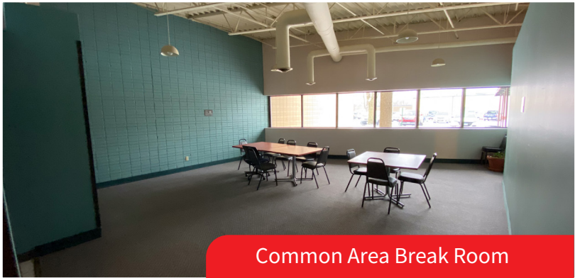
Common Area Break Room