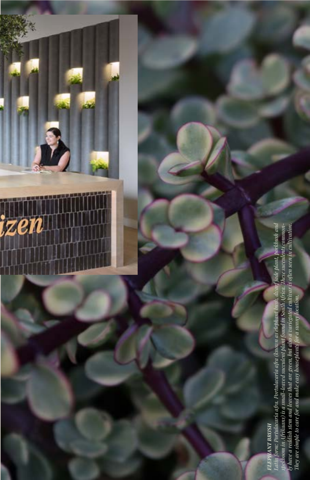
ELEPHANT BRUSH Latin form: Portulacaria afra (known as elephant bush, deerfudge plant, porrbush and spekboom in Afrikaans) is a small-leaved succulent plant found in South Africa. These succulents commonly have a reddish stem and leaves that are green, but also a variegated cultivar is often seen in cultivation. They are simple to care for and make easy houseplants for a sunny location.

Welcome to Arbor, A Denizen's Garden, a refined and organic workplace. This is an ecosystem built to foster community and inspire your most creative work. A natural workspace meant to replenish the soul, while also nurturing the mind. This is an integrated experience with vegetated place-making and a natural refined beauty, while considering a horizontal human-scale. Arbor is a meditative, botanical oasis that is the perfect balance of wellness, hospitality and home.