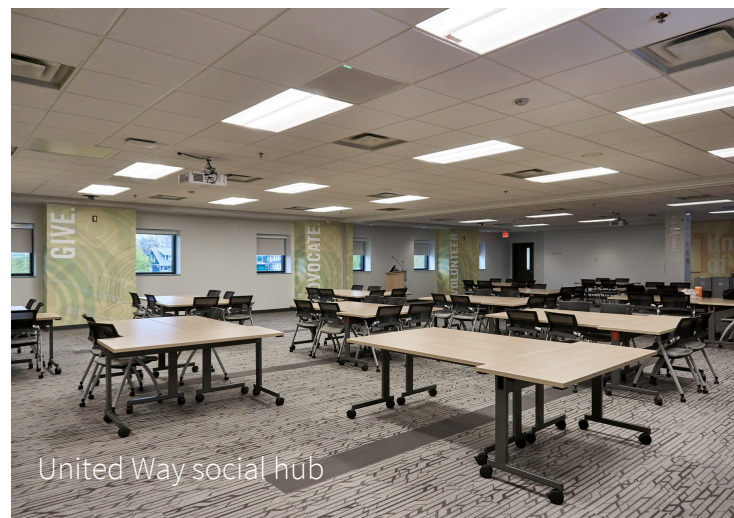
United Way social hub