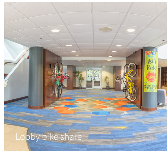
Lobby bike share