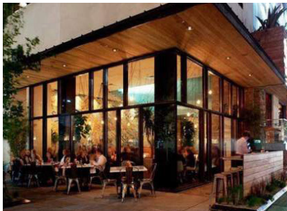
Rich dining experiences