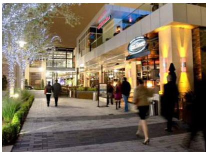
Comfortable retail streets