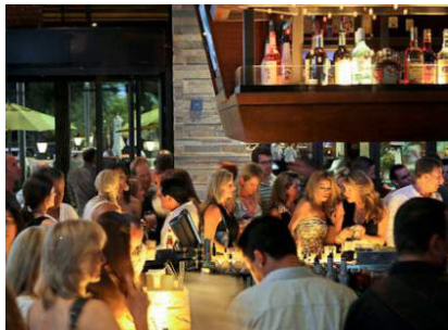
Animated night life