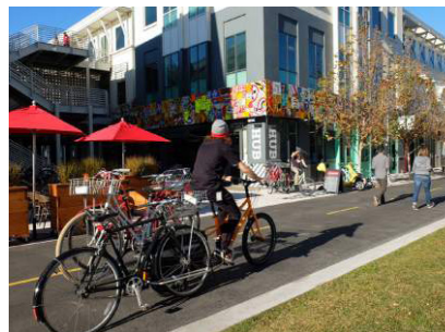
Bike friendly connectivity