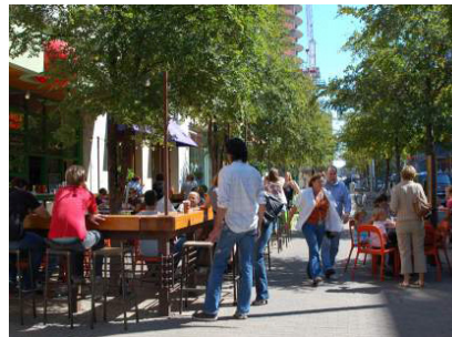
Animated street scapes