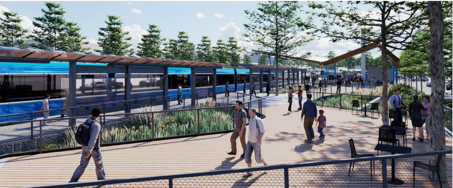
Project Connect, Austin Light Rail Implementation Plan (2023) City of Austin, Project Connect Update Blue Line Bridge (2023) Project Connect, Blue Line Scoping Booklet (2021) KXAN, “ Austin to unveil updated Project Connect light rail scope options next week ” (2023)