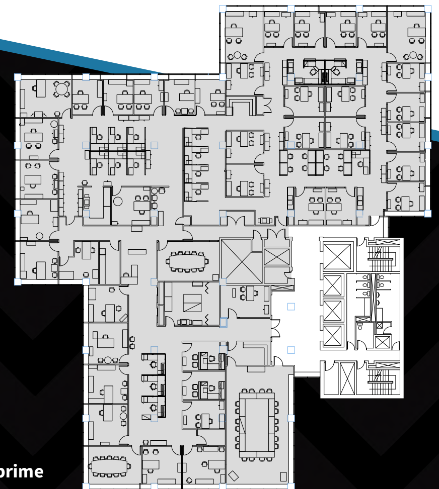
Typical Existing Floor Plan

*Inquire with brokers for more details and each space's floor plan.