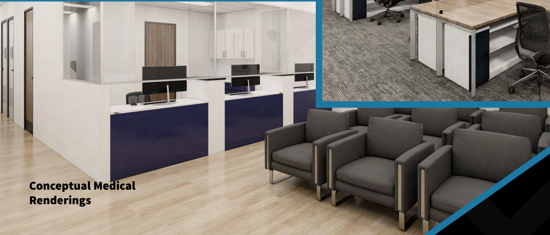
Conceptual Medical Renderings

TAKE A VIRTUAL TOUR OF POTENTIAL OFFICE & MEDICAL SUITES