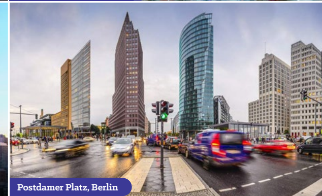
Postdamer Platz, Berlin