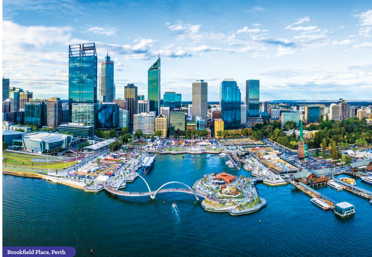
Brookfield Place, Perth