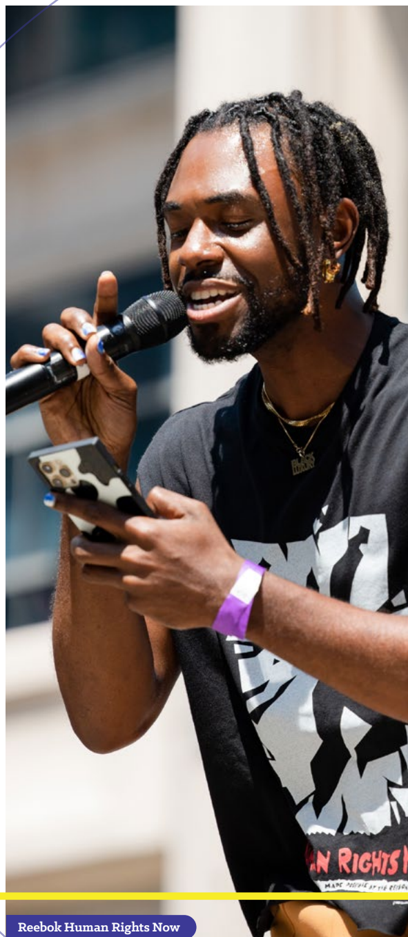
Reebok Human Rights Now