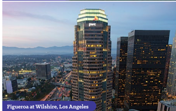
Figueroa at Wilshire, Los Angeles