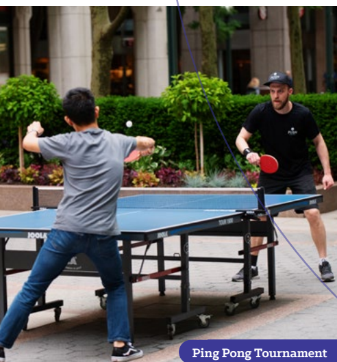
Ping Pong Tournament