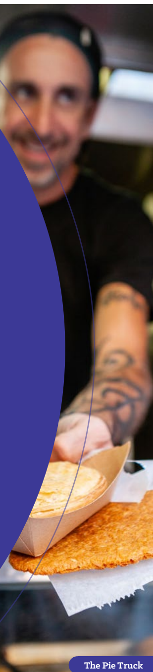
The Pie Truck