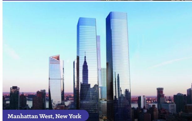
Manhattan West, New York