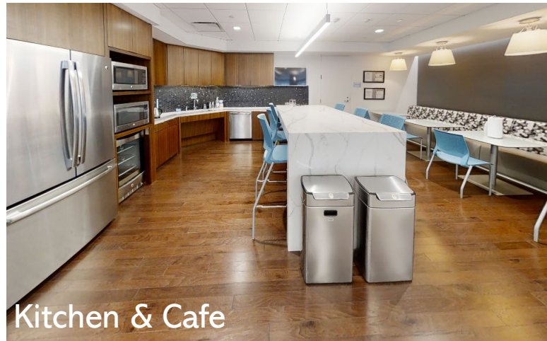
Kitchen & Cafe