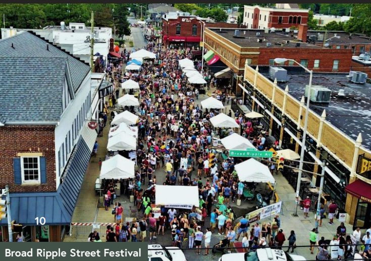
Broad Ripple Street Festival

Within 15 minutes of the highly dense northside suburbs, 30 minutes to additional Indianapolis suburbs, 20 minutes to downtown Indianapolis and 30 minutes to the Indianapolis International Airport