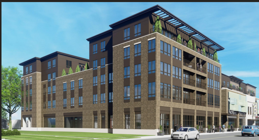
Marko on the Canal - 180,000 SF mixed use with 69 luxury apartments and parking garage