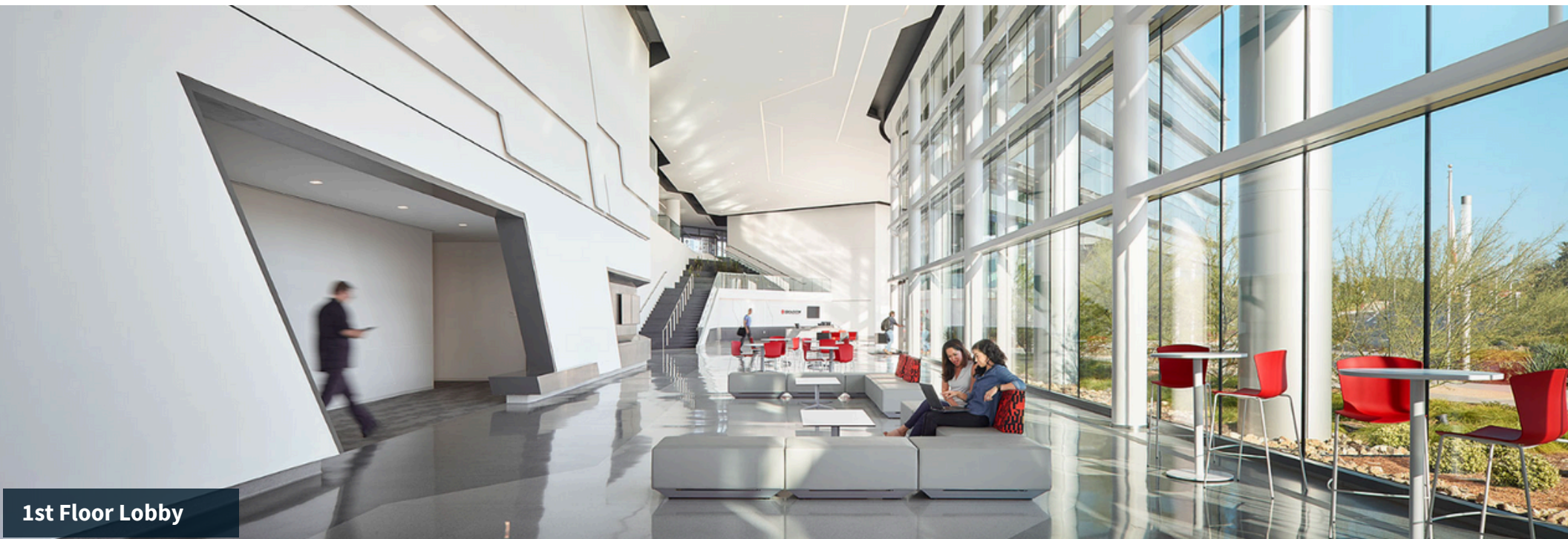
1st Floor Lobby