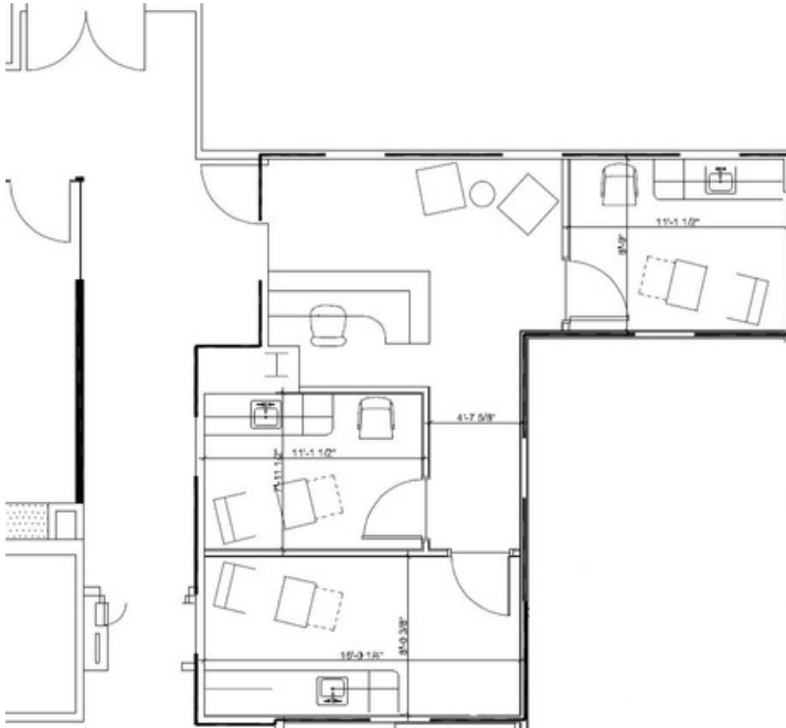
Hypothetical Floor Plan Option 1