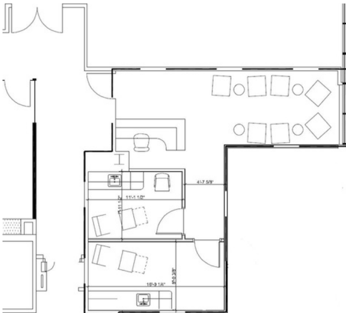
Hypothetical Floor Plan Option 2