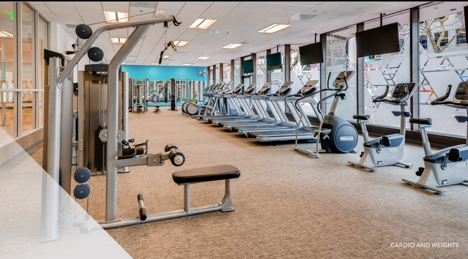
CARDIO AND WEIGHTS