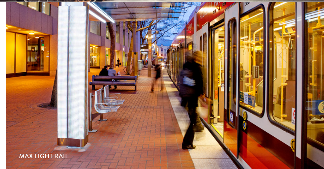
MAX LIGHT RAIL

The Tower has front door access to the Trimet Transit Mall, plus 1/1000 parking, and a large bike hub with repair station.