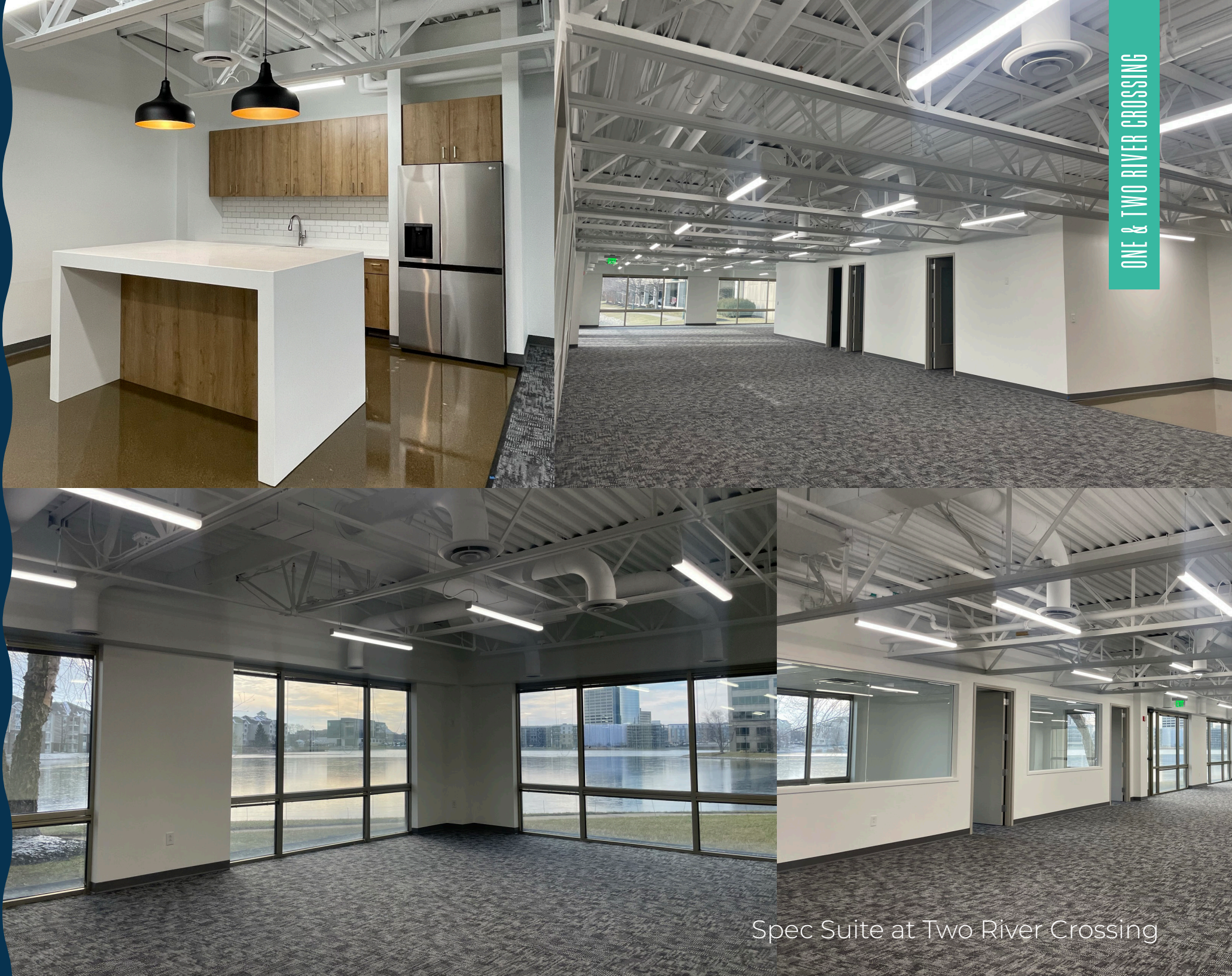
Spec Suite at Two River Crossing