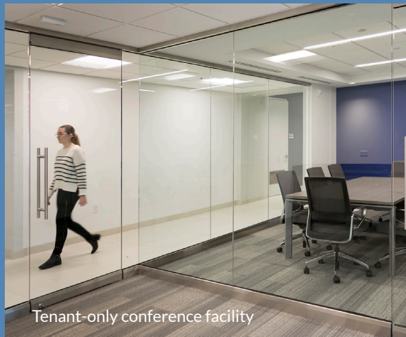
Tenant-only conference facility